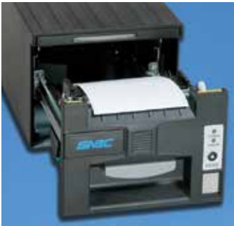
Slide Open For All Operator Tasks Including Drop and Print Paper Loading