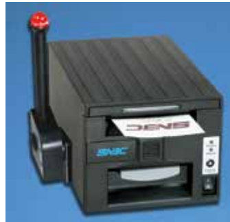
Optional Audio/Visual Print Messenger