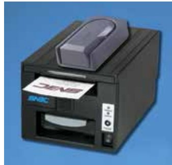
Easily Supports Other Devices, Optimizing Footprint