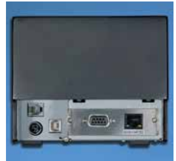
Recessed Connections – Variable Interface Options Available